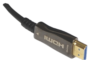
HDMI 2.0 HIGH DEFINITION MULTIMEDIA INTERFACE