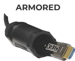
HDMI 2.0 HIGH DEFINITION MULTIMEDIA INTERFACE