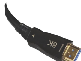
HDMI 2.1 HIGH DEFINITION MULTIMEDIA INTERFACE