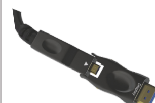
HDMI 2.1 HIGH DEFINITION MULTIMEDIA INTERFACE